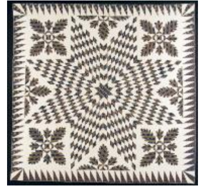
International Quilt Study Center & Museum, UNL, Star of Bethlehem (Circa 1845) 1997.007.0660