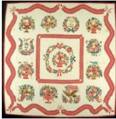
International Quilt Study Center & Museum, UNL Album (1850) 1997.007.0319