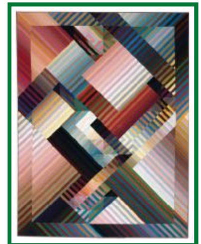
International Quilt Study Center & Museum, UNL Bias Cut (1986) - 1997.007.1068