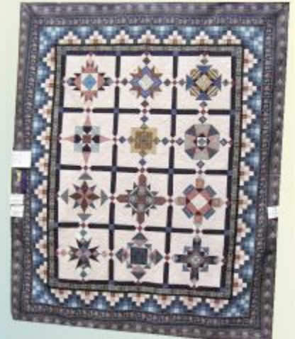
Best Two Person Quilt Arlene Kunes & Peg Pennell