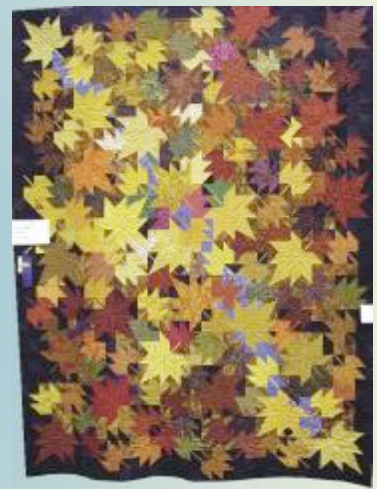
Blue Ribbon Winner Class 3073-Homestead Quilting Linda Gapp