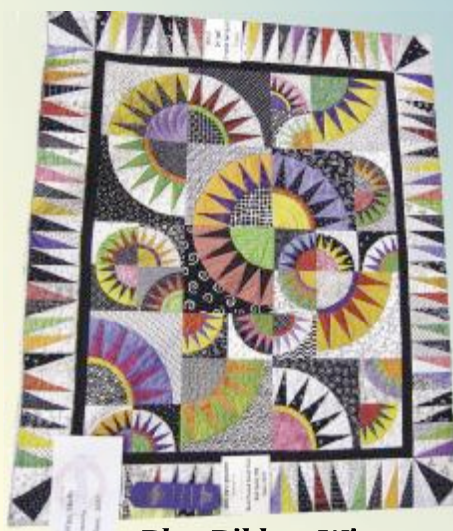
Blue Ribbon Winner Class 2037-Quilters Delight Shelly Burge