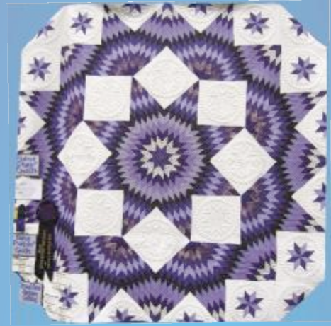
Best Star Quilt and Winner of Purple Contest Kirstin Vierra