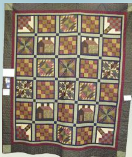
Blue Ribbon Winner Class 2016-Silver Thimble Sewing Center Irene Fisher